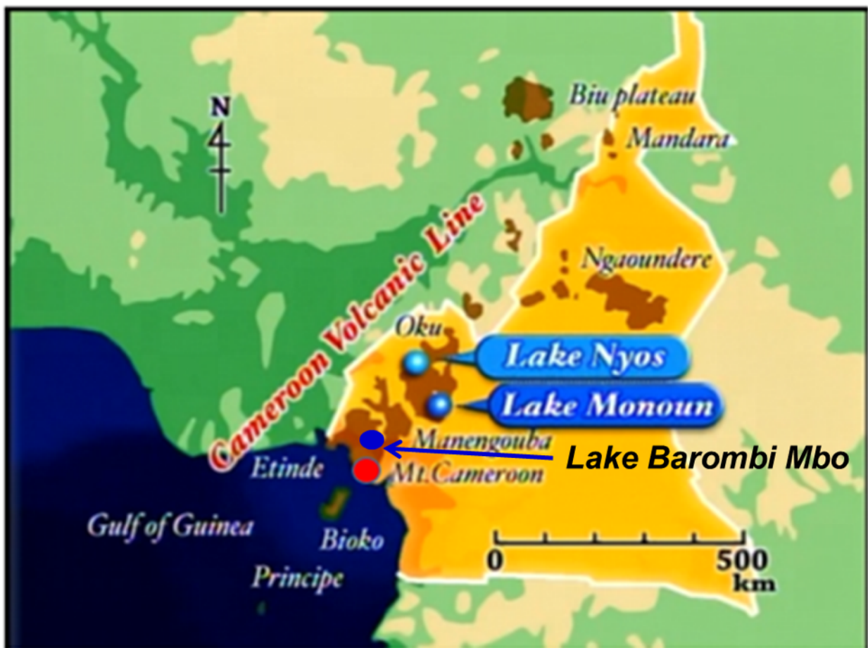
Field trip sites along the Cameroon Volcanic Line

BE AWARE THAT ENTERING CAMEROON GENERALLY REQUIRES A VISA AND A YELLOW FEVER VACCIN. PLEASE PREPARE ON TIME FOR THESE ISSUES!