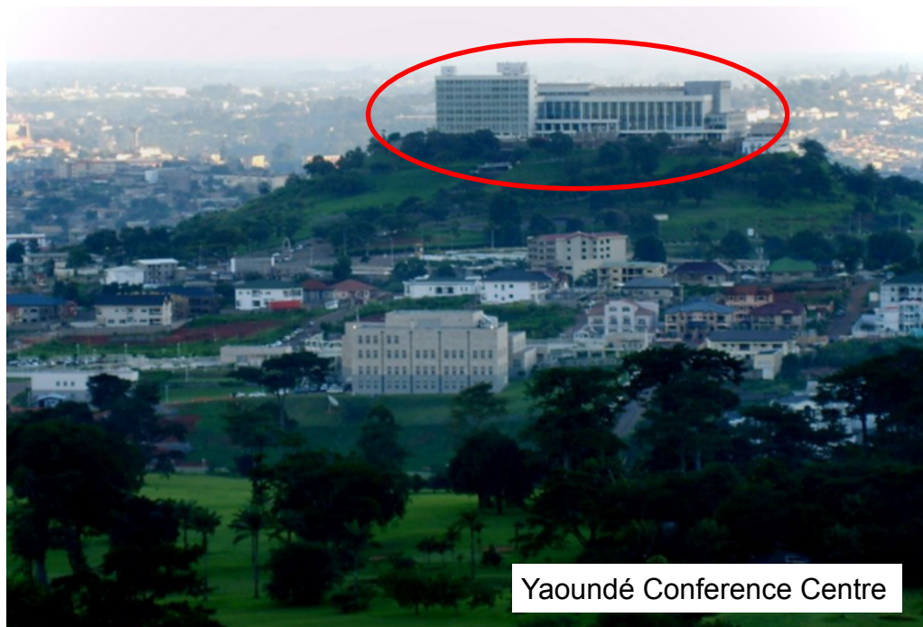
Yaoundé Conference Centre

Venue of the conference: Conference Centre, Yaoundé