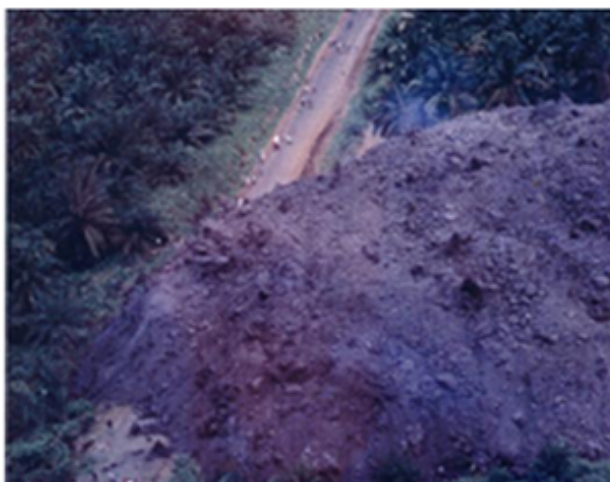
1999 lava flow cuts Limbe-Edenau highway